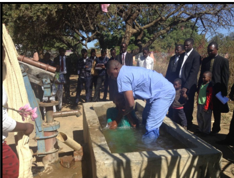
Baptism in Zimbabwe